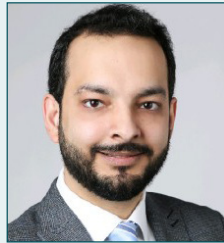
Bhiren Jivani International Wealth Solution