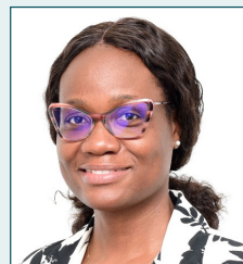
Xorlali Torsu Standard Chartered Bank Ghana